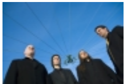
Dogbreath "Taste It"

"When you receive a release like this you can't drool just enough; no matter how many superlatives I can muster to throw at it - you still won't understand just how fresh and joyous a listening experience this is!"